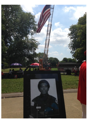
Picnic in Brown Park, Brown Memorial Park, 634 E. 86th St.

October marks the first full month of the fall season and it's either the time where Chicagoans delight in the brisk weather or mourn the passing of the summer sun. Regardless of your cold vs. hot weather stance, put your hats and hot chocolates to the side for now and bask with us in the summer accomplishments of Park Advisory Councils across the city. From park openings, to playground ribbon cuttings, to carnivals, to volunteer days, PACs have continued to make great contributions to their communities and parks. The following are just a fraction of the PAC highlights from the summer.