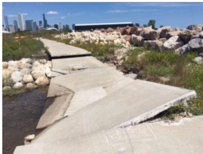
Collapsed concrete biking and walking path

Below is a photo of the Northerly Island concrete sidewalk and bike path, thought to have been protected by an ACOE-installed boulder revetment, but which collapsed due to wave action and erosion in the winter of 2016. Northerly Island is located approximately 10 miles from the proposed site of the expanded Calumet Harbor CDF.