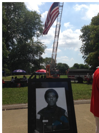
Picnic in Brown Park, Brown Memorial Park, 634 E. 86th St.

October marks the first full month of the fall season and it's either the time where Chicagoans delight in the brisk weather or mourn the passing of the summer sun. Regardless of your cold vs. hot weather stance, put your hats and hot chocolates to the side for now and bask with us in the summer accomplishments of Park Advisory Councils across the city. From park openings, to playground ribbon cuttings, to carnivals, to volunteer days, PACs have continued to make great contributions to their communities and parks. The following are just a fraction of the PAC highlights from the summer.