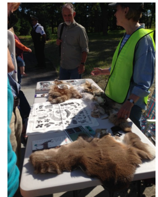
West Ridge Nature Preserve Grand Opening, 5801 N. Western

third year. Chicago Kite gave away 300 kite kits and had kite flying demos of some gloriously monstrous kites! Catch and release fishing, readings by Chicago Public Library staff, scavenger hunts, and delicious food for sale by local vendors were just a smidgen of the activities offered during the event. Congrats to the Henry C. Palmisano Nature Center Advisory Council for another outstanding year! And a special shout-out to the McGuane Park Advisory Council for co-presenting the event!