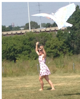
3rd Annual Bridgeport Air & Water Show, Palmisano Nature Park, 2700 S. Halsted

After years of organizing, fundraising, and holding true to a dream, the Logan Square Dog Park Committee finally saw the opening of the Logan Square Dog Park, also known as Park 556. On a perfect summer day in August, the LSDPC gathered local vendors and animal shelters who tabled on the open area beside the small dog play section. Dozens of community members and their pooches made new friends that day, while playing in dog pools, chatting with neighbors, or playing a game of fetch. Congrats to the Logan Square Dog Park Committee on a great event! The skies the limit with what the LSDPC will do next. We hear they have a great vision for a phase 2 project. Woof!