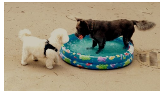
Logan Square Dog Park Grand Opening, Logan Square Dog Park, 2529 W. Logan Blvd.