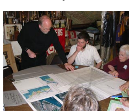
Park plans were developed by the residents of adjacent communities.