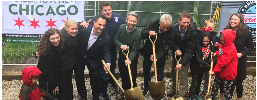
Wildwood Park, 6950 N Hiawatha Ave. Article submitted by the Wildwood Park Advisory Council.

In the spring of 2017, the Wildwood Park Advisory Council formed so that the community could advocate for new playground equipment after a series of incidents wherein equipment was vandalized, resulting in the removal of 2