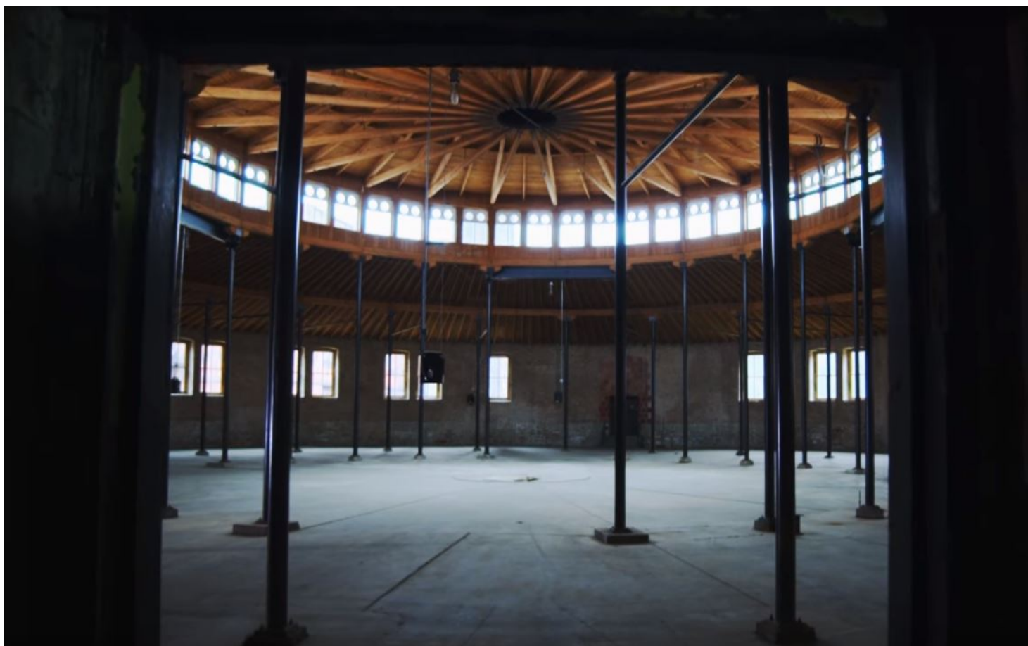
Washington Park Roundhouse

A historic building sits vacant on the city's South Side. Designed by famed Chicago architect Daniel Burnham, the 61,000-square-foot structure, called the Roundhouse, was first a 19th century stable, later housing theatrical costumes and sets in the 1930s. But now it just looms, cold and vacant, staring across the street at its sister, the DuSable Museum of African American History – another Burnham original which has tried unsuccessfully for more than 10 years to bring the empty stable back to life.