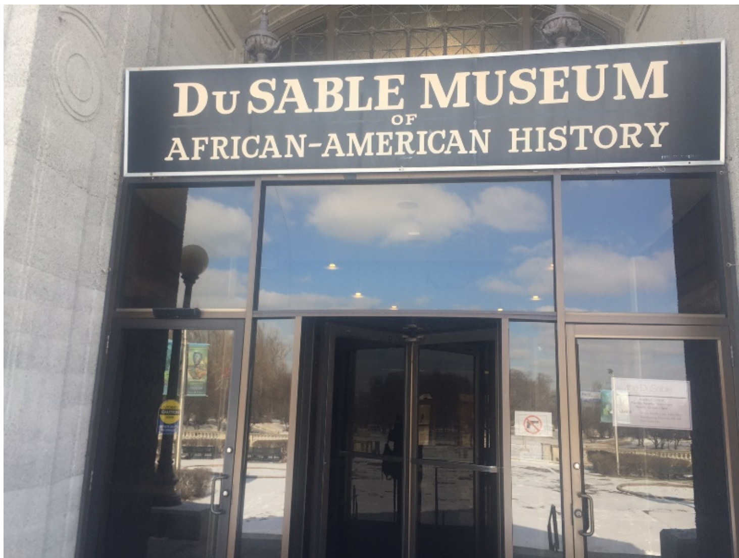
The DuSable Museum of African American History