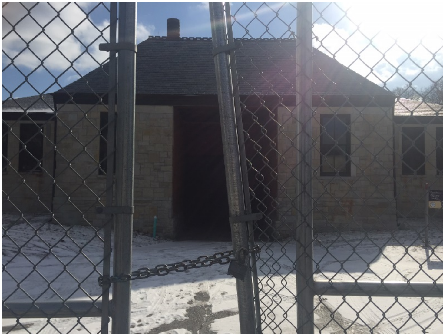
The DuSable Museum's Roundhouse (Chloe Riley)

But as plans for Chicago's historic Barack Obama Library shape up on the South Side, the pressure on the DuSable to complete the building – and reestablish its relevance as an African-American landmark – becomes more real by the day. The location of the $500 million library has already been narrowed down to two sites, one in Jackson Park and the other in Washington Park. Both sites flank the museum, which, if it can up its game and provide a higher caliber experience, will almost certainly benefit from the library's presence.